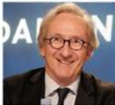
Franck Riboud 1996-2014